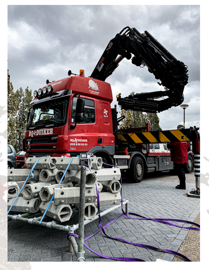
Reef installation in Amsterdam

The Modular Sealife System can be installed in various ways. Structures can be built up on a frame on land or on a ship, where after they can be submerged using a crane. With lifting balloons, it would be possible to transport the complete structure through the water. For more stability and weight is also possible to replace the iron frame with a stelcon plate.