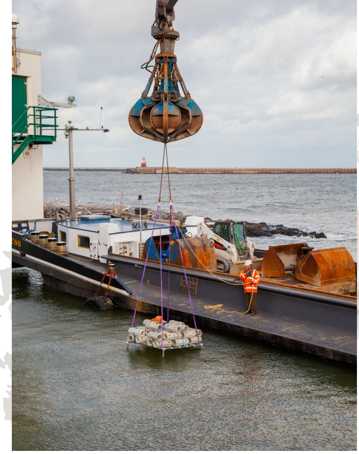
Reef installation in IJmuiden